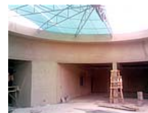
Ipapa Training Facility View Full Size