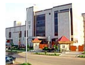
The High Court, Abuja