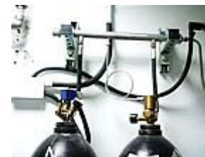
NIB Water Mist