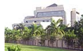
NDIC View Full Size