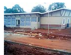
Ipapa Project View Full Size

Organic growth in Mechanical & Electrical services (41.5% of Sales) was higher in Building services due to the increase in the integrated Building solutions.