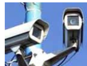
The Lagos Trade Fair